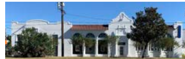
Broad Theater: front façade - MID-CITY

and small business owners to revitalize their building façades. The program is designed to eliminate blight and enhance the economic viability of commercial corridors around the city, and it is currently being implemented on portions of North Broad Street, St. Bernard Avenue, Alcée Fortier Boulevard, and Basin Street.