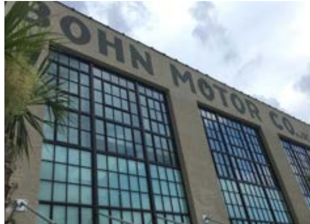
Newly renovated Bohn Motor Company building - BROADMOOR

NORA provided a $500,000 Commercial Corridor Gap Financing loan to assist with the historic rehabilitation of the former Bohn Motor Company automobile dealership located at 2700 South Broad Street. The renovations were completed in August 2019.