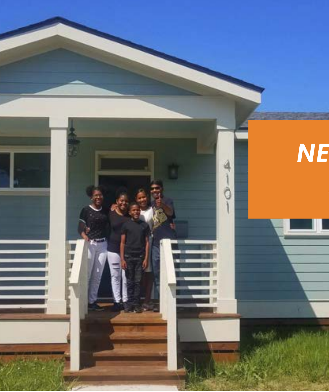
Orleans Housing Investment Program - GENTILLY