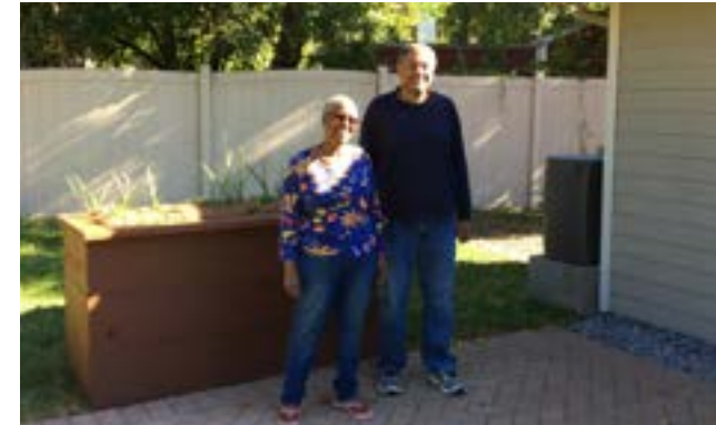
Community Adaptation Program participants with newly installed stormwater planter box and pervious pavement - GENTILLY

Since July 2019, 16 residential properties in the Gentilly Resilience District have been fitted with green infrastructure improvements as part of NORA's Community Adaptation Program (CAP) . Together, these completed projects are able to manage almost 20,000 gallons of storm water . Councilmember-At-Large Jason Williams applauded the program's impact during the recent 2020 Budget Hearings, stating that green infrastructure, "is the future of the City of New Orleans . . . Everybody's got to do [their] part, whether it's a small bioswale or a rain barrel on every house, that is how we can last another 300 [years]."