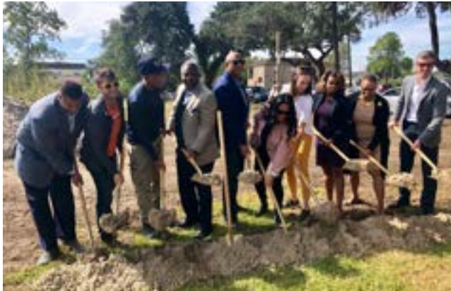
Orleans Housing Investment Program Update and Phase II Groundbreaking - LOWER 9TH WARD

NORA recently held a program update and second phase groundbreaking ceremony for the Orleans Housing Investment Program (OHIP) in the Lower 9th Ward . NORA has partnered with developers to provide quality energy efficient homes to families that meet specific income requirements. In addition to providing the land for development, funds are also available to both the homebuyer and the developer to make the dream of homeownership a reality for families who might otherwise be unable to purchase a home.